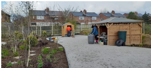
Left: With "Time for Me" we have visited Chapter who have been fixing up The Haven in Ellesmere Port. Here are the pictures of their finished garden. We will be having some events in the garden and you can enjoy all the hard work everyone has done. We will also be visiting other gardens such as Grozone in Northwich and one in Little Sutton.

We also have a Carers in Employment support team as juggling a job and caring is hard. Our team can help you plan those difficult conversations in work and help support you with making changes at work if needed. If you're an employer and would like free support from us in becoming a more carer aware/carers friendly employer. Email our team at carersinemployment@cheshireandwarringtoncarers.org