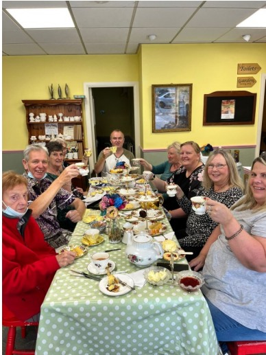
Right: We had an amazing time having afternoon tea, lots of cake and scones were consumed. Are you a jam first then cream on a scone, or the other way round? We would love to know!