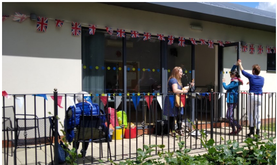
To celebrate the Queens Platinum Jubilee, carers in Chester were invited to a garden party in Upton Park. Carers joined in the celebrations with live music, games and crafts.