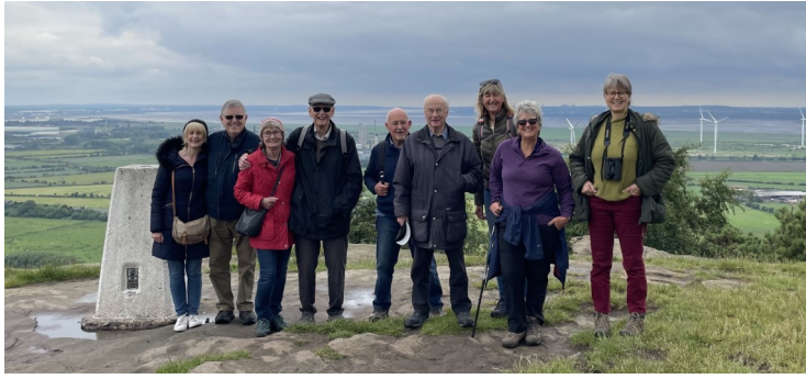
Above: We did a walk to Helsby Hill in the Ellesmere Port Walking Group. We really enjoyed the struggle trying to reach the top however it was all worth it as everyone felt accomplished.