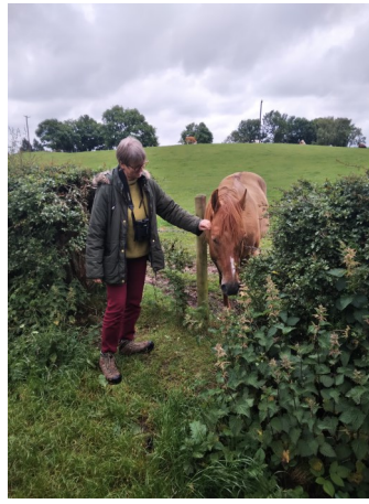
Above: We had an alpaca walk with carers. These cute fuzzy animals certainly gave these carers a laugh. It was definitely a refreshing change from life and of course alpacas are perfect to cuddle. We even saw a horse in the field nearby.